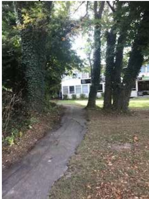
Zone 5. Decaying Tree reported. Area opened for safety.