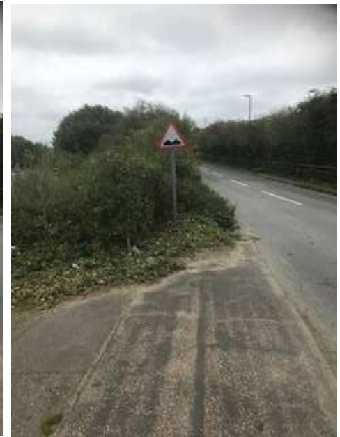
Area attended to Zone 5, due to footfall safety, brambles and vegetation was causing concern for members of the public.