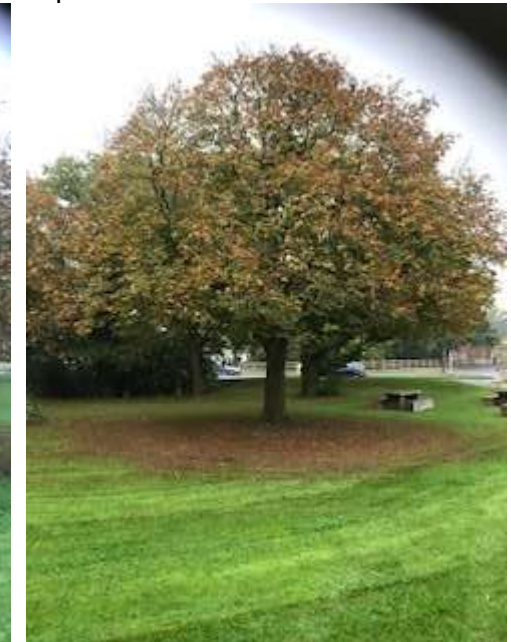
Crawters Brook, tree lifted for safety aspects and looks aspetically pleasing