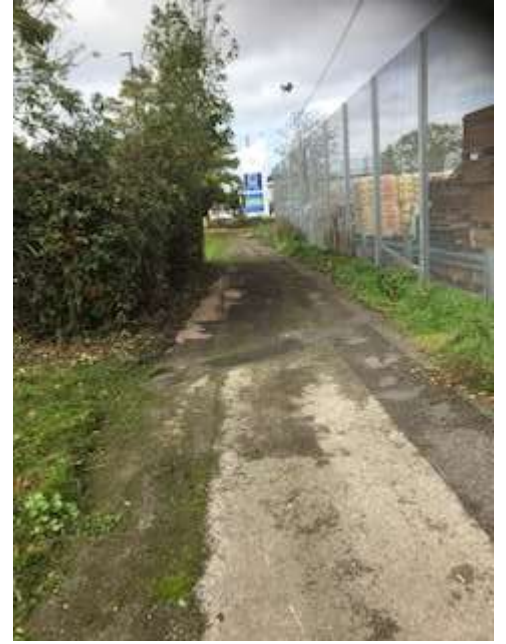
Zone 1 Area by Pets at Home. This needed a hard cut back as it is a high footfall area and is being used more due to expanding Retail Park. Was hazardous to public safety