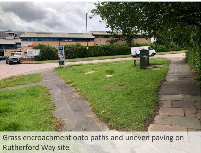
Grass encroachment onto paths and uneven paving on Rutherford Way site