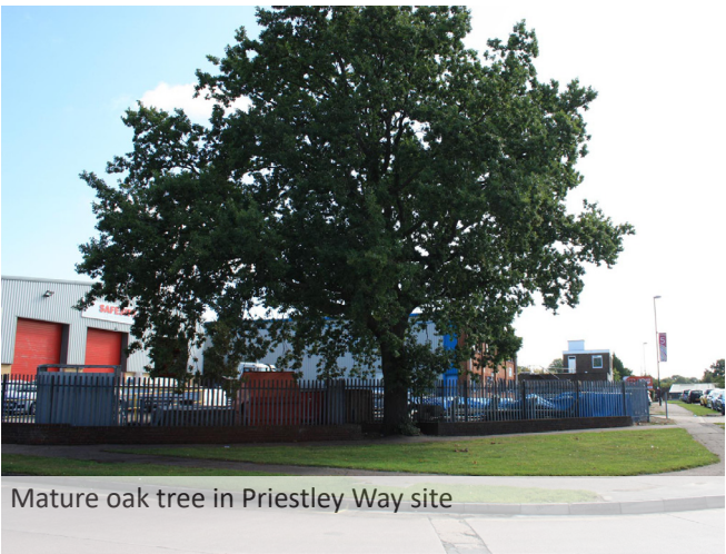
Mature oak tree in Priestley Way site