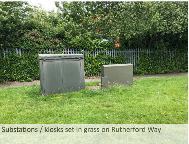
Substations / kiosks set in grass on Rutherford Way