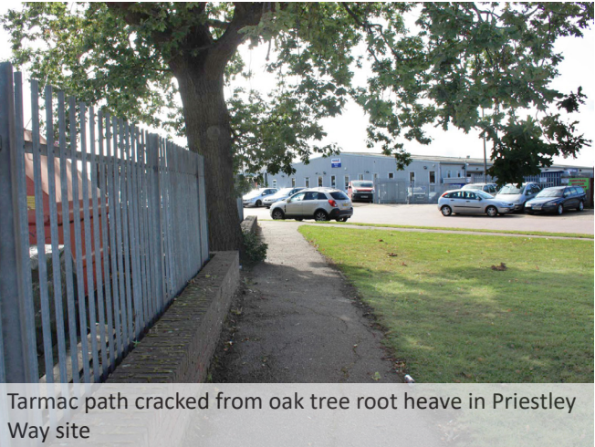
Tarmac path cracked from oak tree root heave in Priestley Way site